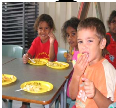
Pre-schoolers enjoying the meals they made.

Years 4-6: Students in years 4-6 have been participating in a unit of work on space. They have enjoyed learning about our place in space as well as interesting facts about rockets, planets and space adventures. They have also begun a