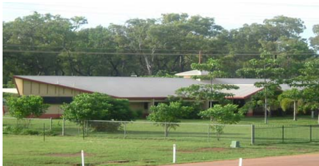
Council Chambers looking good thanks to a big effort by Mapoon's CDEP workers.