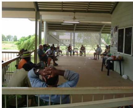
Men's Group meet on Health Clinic verandah