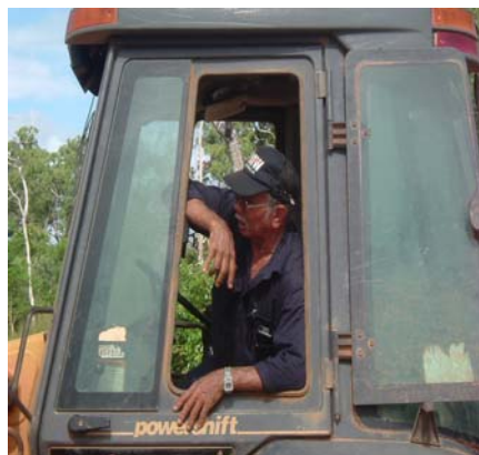
Uncle Silver shows off his skills with a bob-cat.