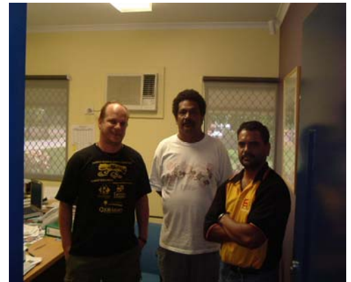
The Mayor meets the boys from Bush TV