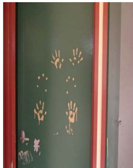
Part of the damage caused to one of the new houses. This door and some windows will have to be replaced, the floor and walls repainted.

Mapoon is our place and the houses are for Mapoon people. The money spent on repairing this sort of damage just slows down the building of new homes