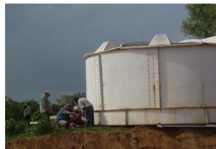
Work begins on the delicate task of moving the tank

The 2.4 tonne tank was taken through Town to the new Sport and Recreation Centre.