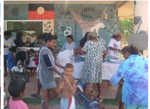
Women's Group bar-b-que outside the Shop.