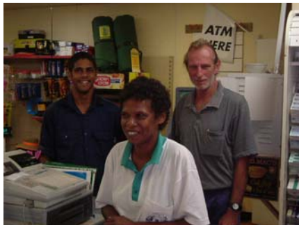
Some of the happy staff at the Mapoon Shop

"We've had a lot of Weipa people coming to Town recently to buy the veggies, milk and meat they